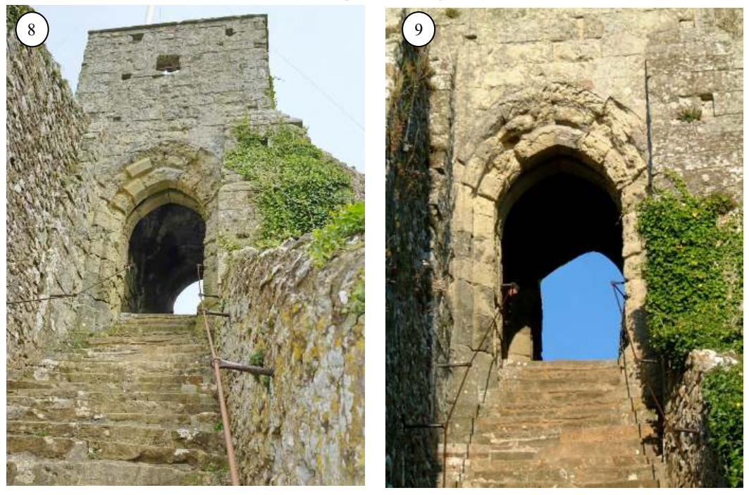
ABOVE: Figs. 8, 9. 71 steps up to the gatehouse. The arch shown right (picture taken in 2005), has since been repaired with two new blocks inserted (2010) (see fig. 8 & cf fig. 7). There was one portcullis in the gatehouse, but two in the outer entrance.

BELOW: Fig. 10. Left: Quadripartite ribbed vaulting in the outer gatehouse bay c. 1335. Fig. 11, Right: Transverse vaulting in the inner bay, c. 1285, viewed from inside the keep looking out. For the vaulting patterns see fig. 6.