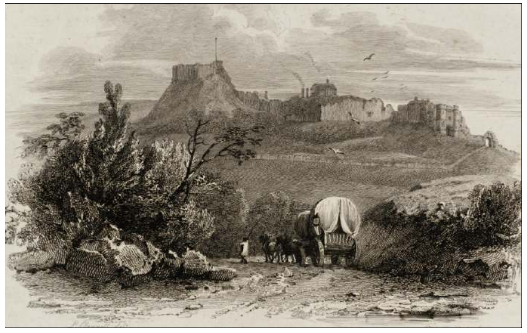
ABOVE: Fig. 2. After Luke Clennell (1781–1840) 'Carisbrooke Castle from the Calbourn Road' From 'Picturesque Views on the Southern Coast of England', 1814. BELOW: Fig. 3. F. G. Sargent, engraved by E. Radclyffe. From W. Beattie, Castles & Abbeys of England (1842-44)