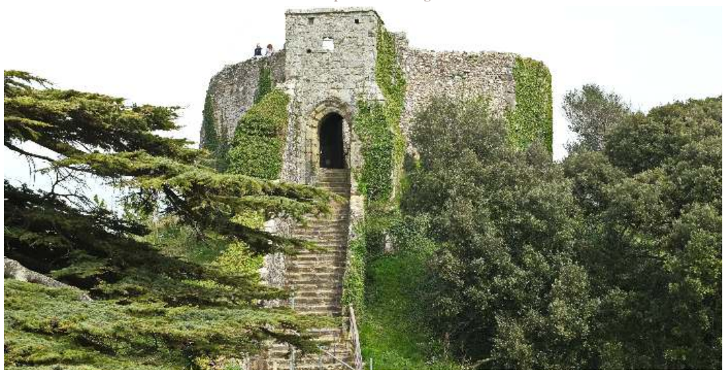
Fig. 1. Carisbrooke Castle shell-keep, c. 1130-40 with added gatehouse and portcullis c. 1335.