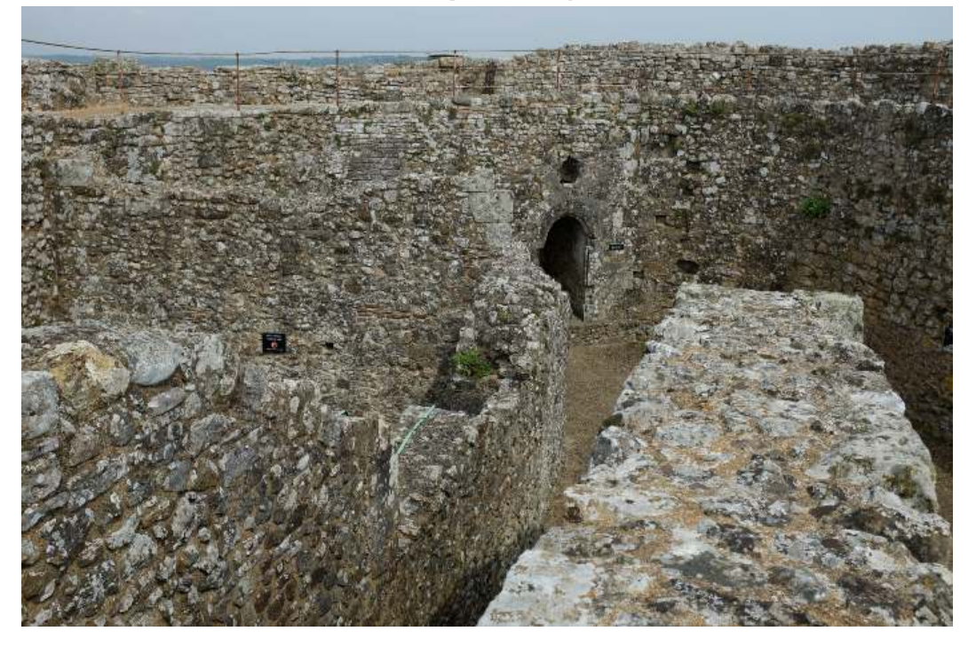
ABOVE: Fig. 16. Carisbrooke. Looking east from the gatehouse. The well is in the chamber to the left (158ft deep). BELOW: Fig. 17. The long straight south wall. Possibly the original location for the lean-to domestic accommodation. The current guidebook suggests this section of wall was rebuilt in the 14<sup>th</sup> century.