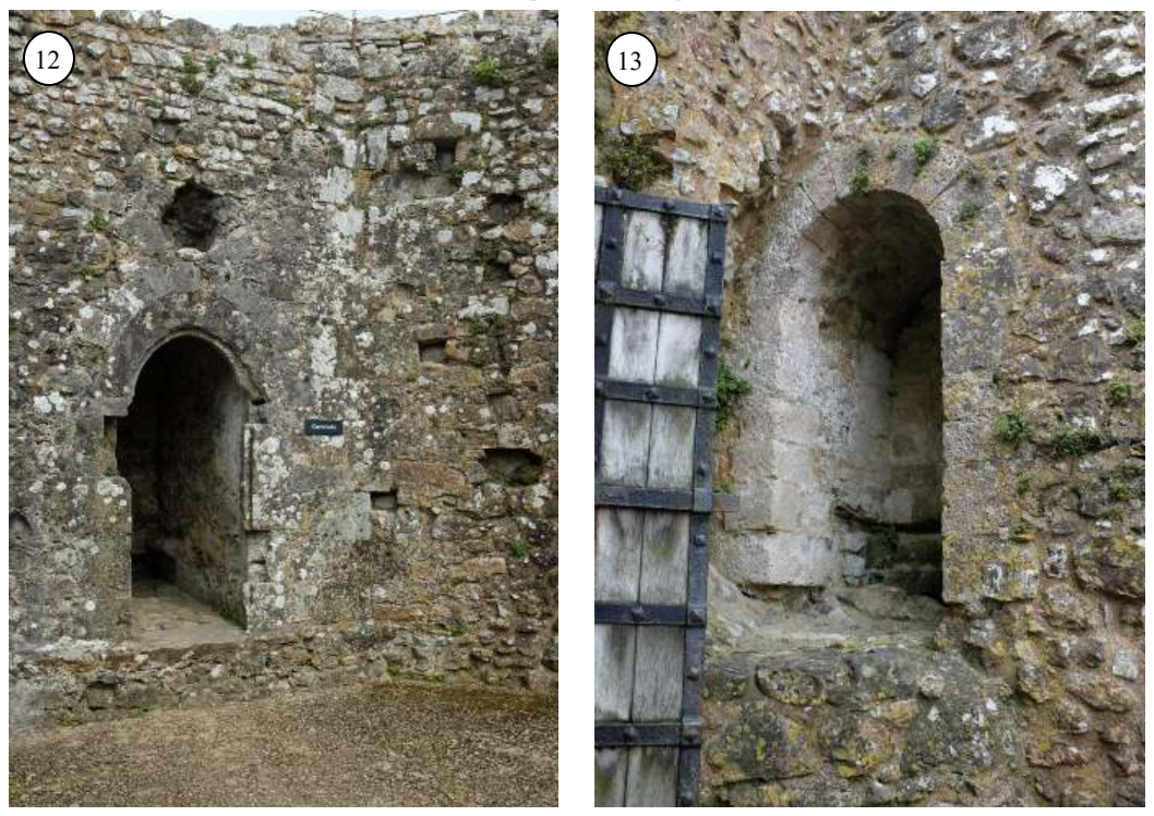
Figs. 12-15. The interior of the shell-keep. 12: Garderobe (inserted early 14th century?) on the east wall (with no dogleg). 13: Garderobe on the north wall (also seen in fig. 14, right). 14: Looking west along the curious high-walled corridor to the entrance gatehouse. Probably a post-medieval 16<sup>th</sup>-century addition. 15: One of two arrow loops on the top of the gatehouse.