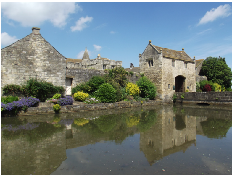
The glorious moated Markenfield Hall , Yorkshire