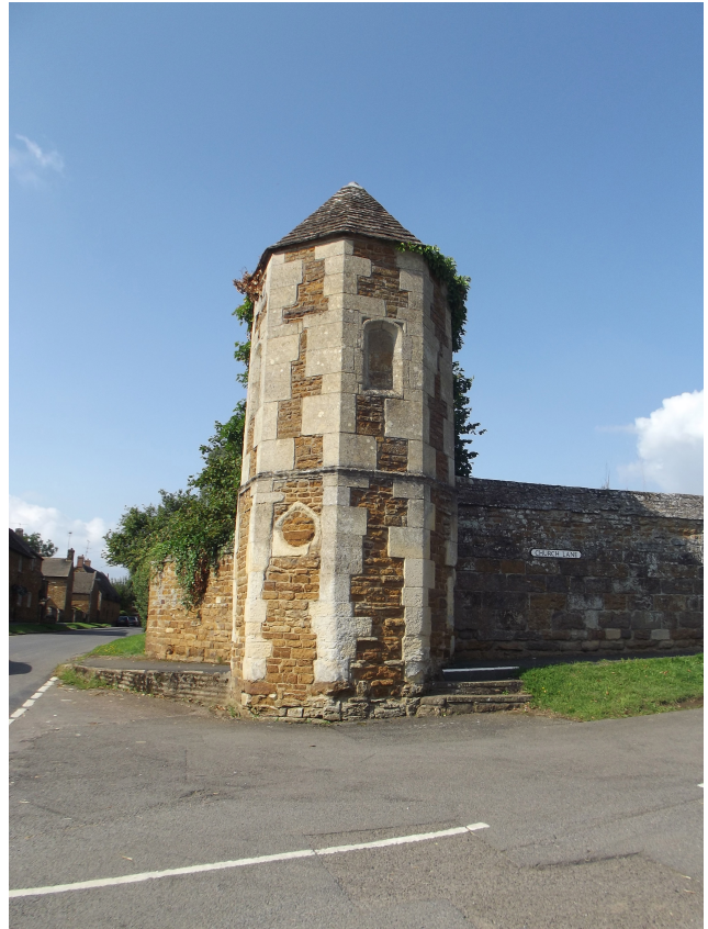
Lyddington Bishops Palace

A short trip to Lyddington Bede House, a former palace of the bishops of Lincoln, inspired me to add a listing and distribution map of post-Conquest pre-Reformation episcopal palaces and houses organised by diocese (or see). The map is rather limited and really needs to show the boundaries of the dioceses and I hope to improve it in the future.